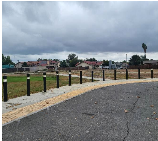
Vacant Lot Next to GNC