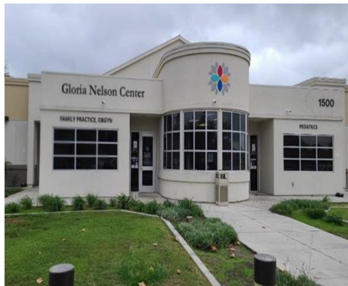
GNC Front Visitor Entrance