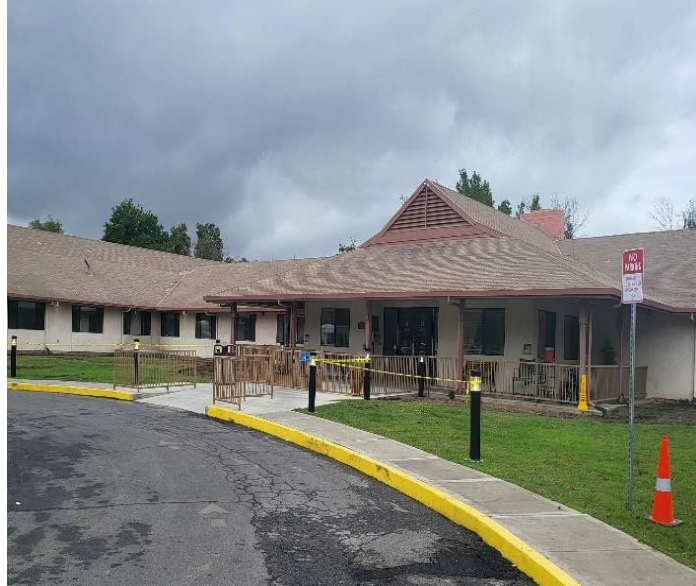
DDSNF Front Visitor Entrance