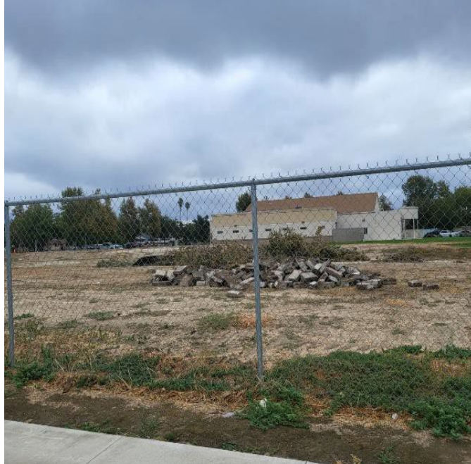
Back Corner of Vacant Lot