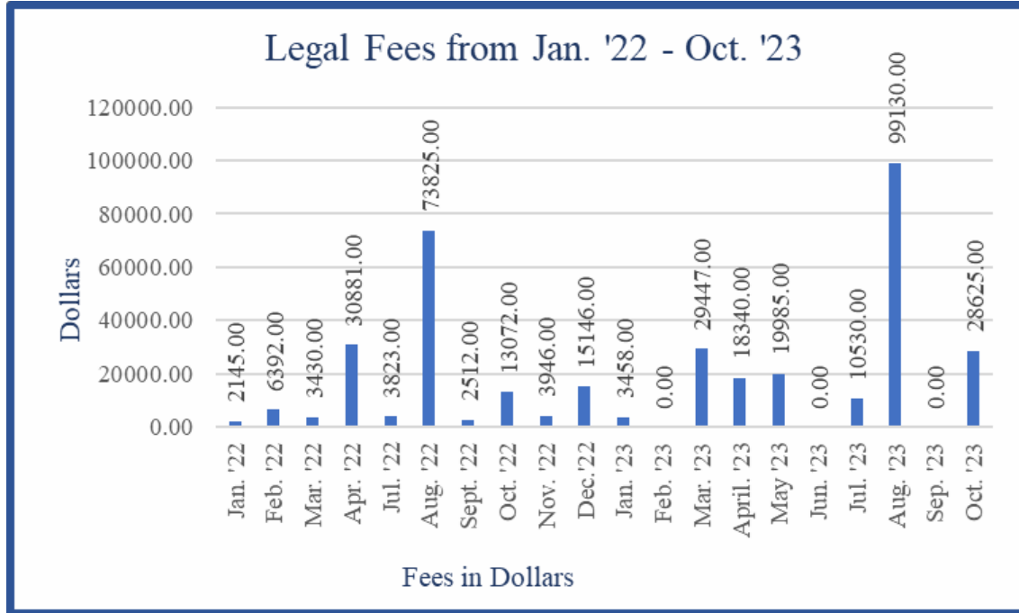
Chart developed by the Grand Jury taken from Monthly Income Statements

The rates for legal services with the previous legal counsel were: